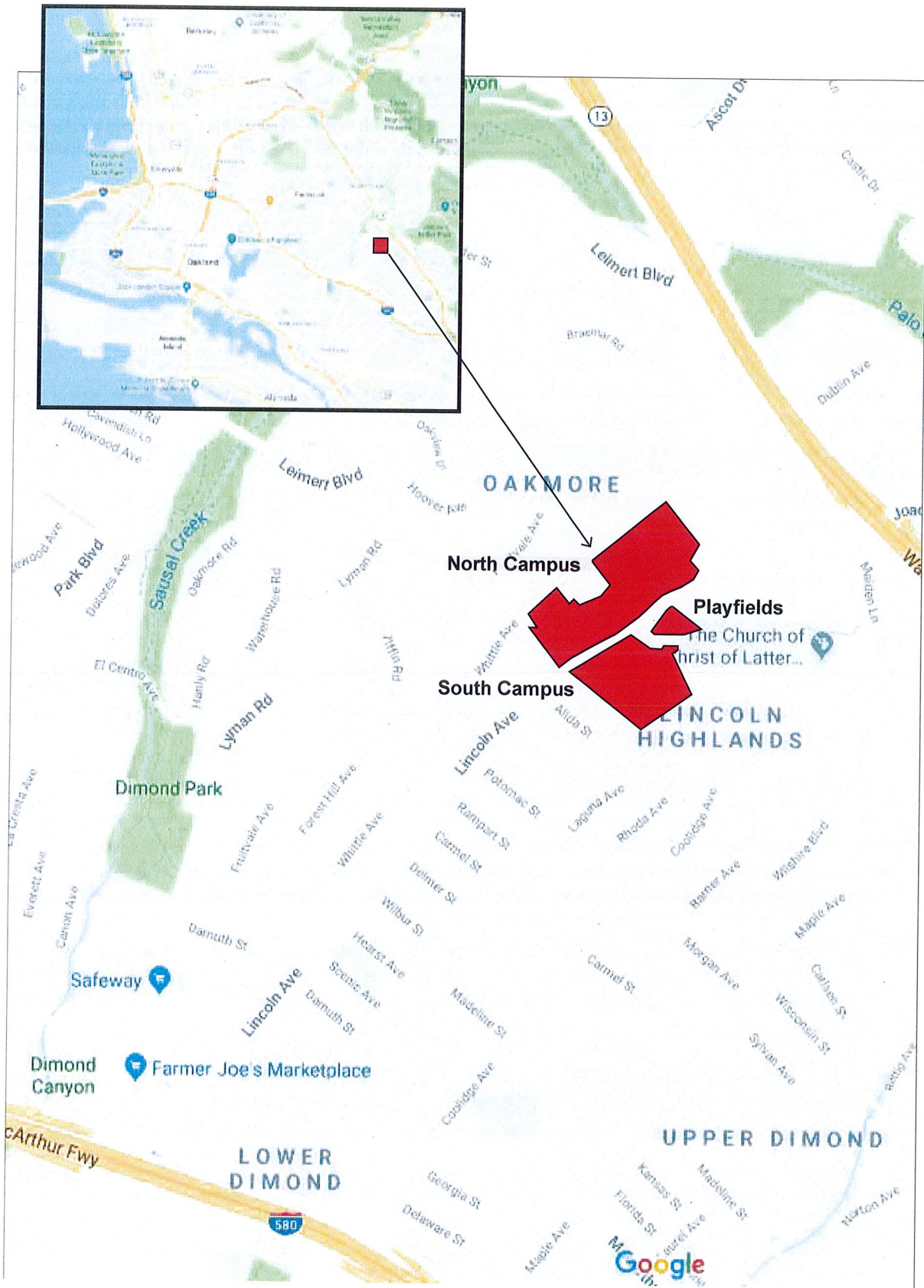
Figure 1 Project Location