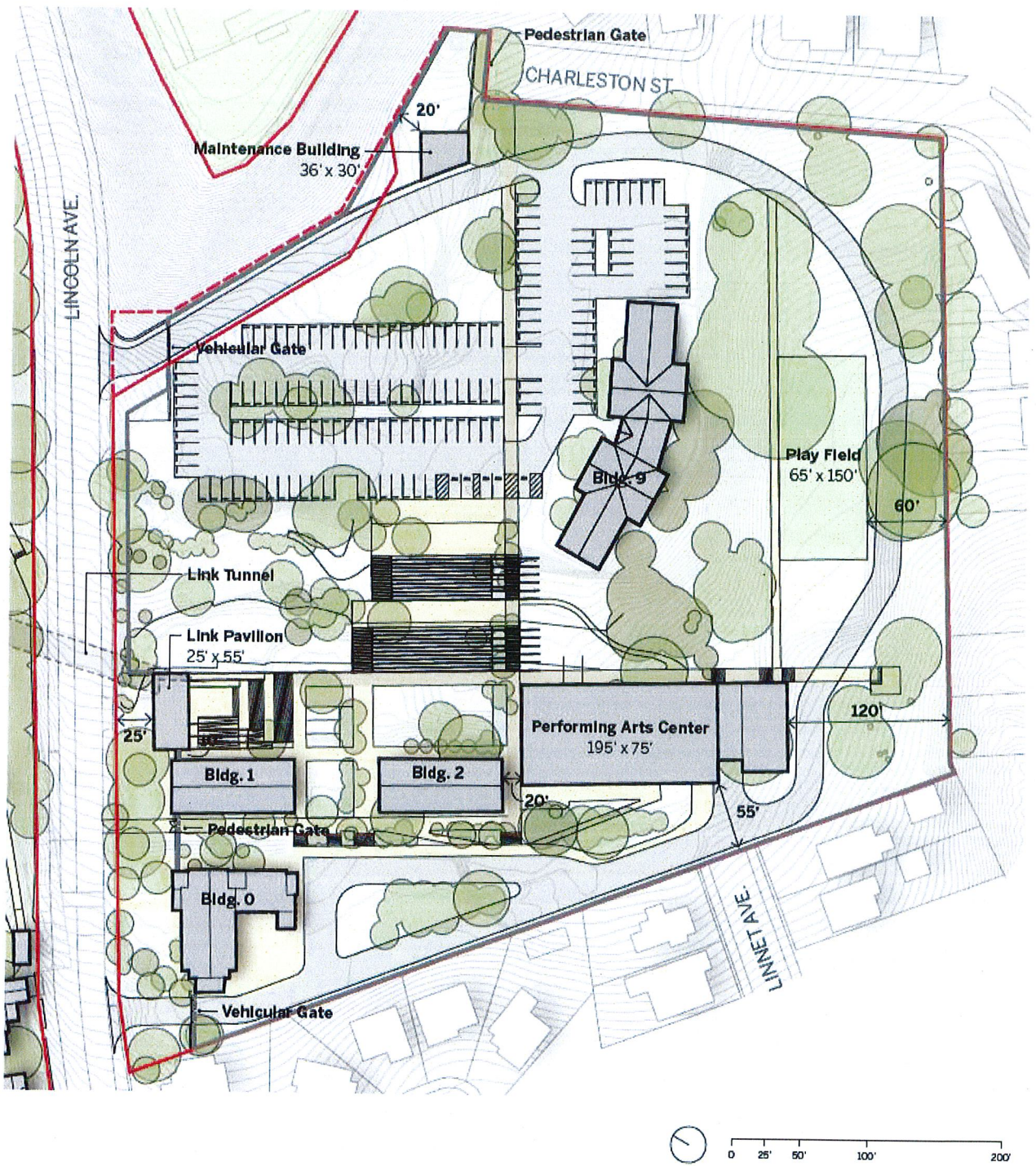
Figure 3 Head-Royce School South Campus Master Plan