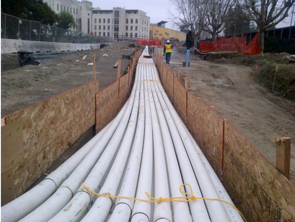
02/17/2015: New AT&T Joint Trench to the Bridge