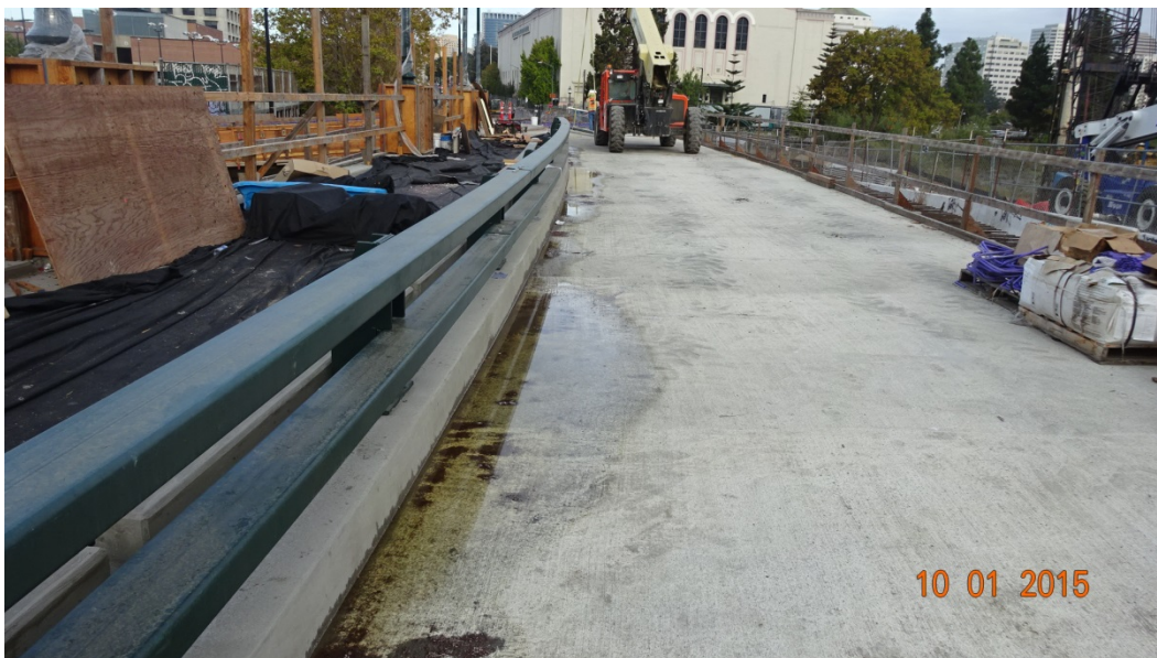
10/01/2015: Guard Rails on Southside of 10 th Street