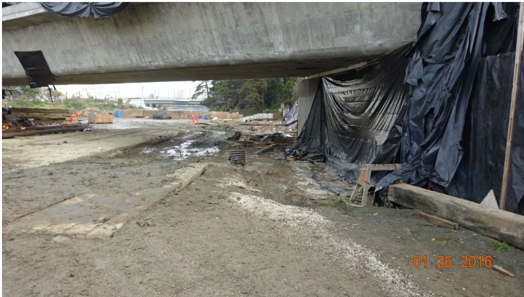
1/26/2016: View from Southern Half of the Bridge Span