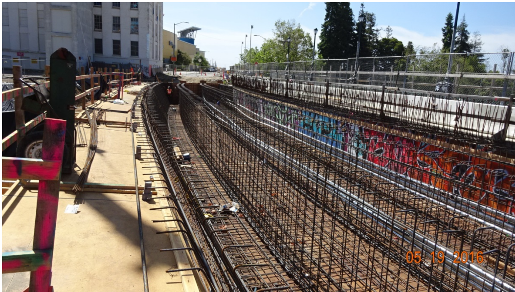
5/19/2016: Installation of Rebar for Northern Half Bridge Soffit