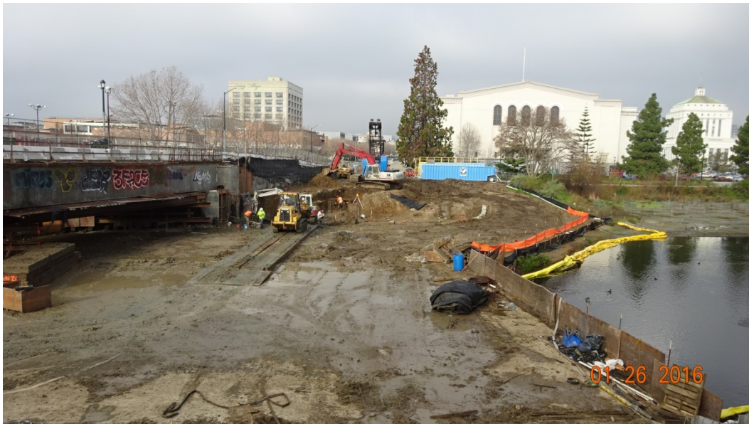
1/26/2016: Excavation of Northwest Quadrant of the Bridge