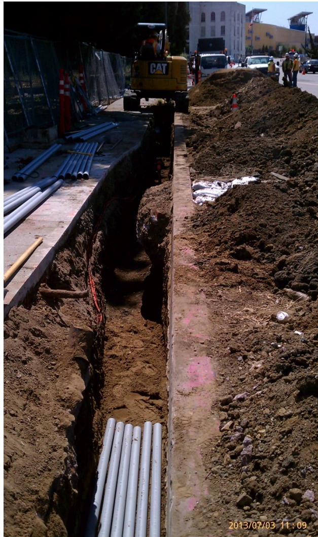
07/03/2013: Phase 1 Demo – Excavation for AT&T Joint Trench