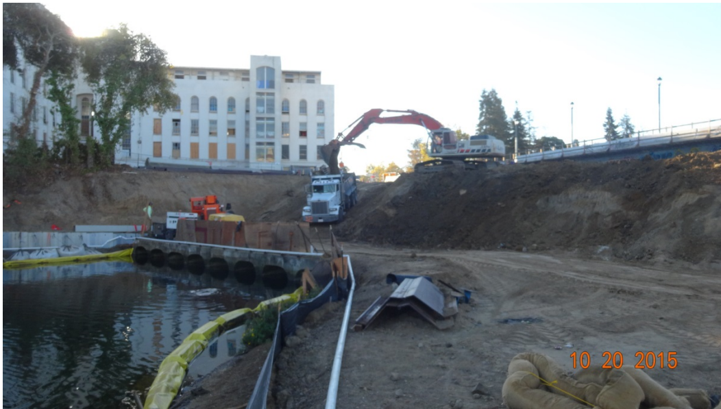
10/20/2015: Excavation of the Northern Half of 10 th Street