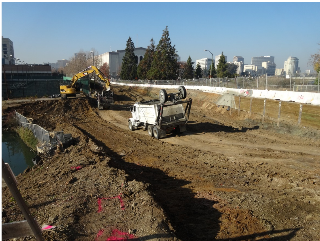
12/11/2013: Phase 1 Demo - Southern Half of 10 th Street