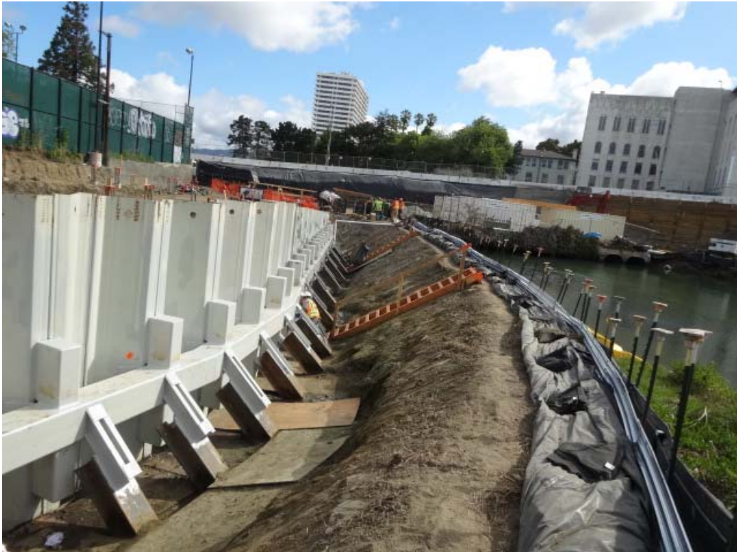
05/09/2014: Sheet Piles for SW Retaining Wall 4