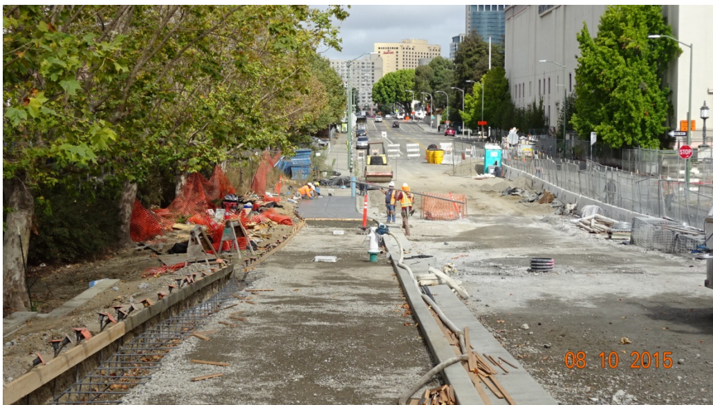
08/10/2015: Construction of New Sidewalk along Laney College