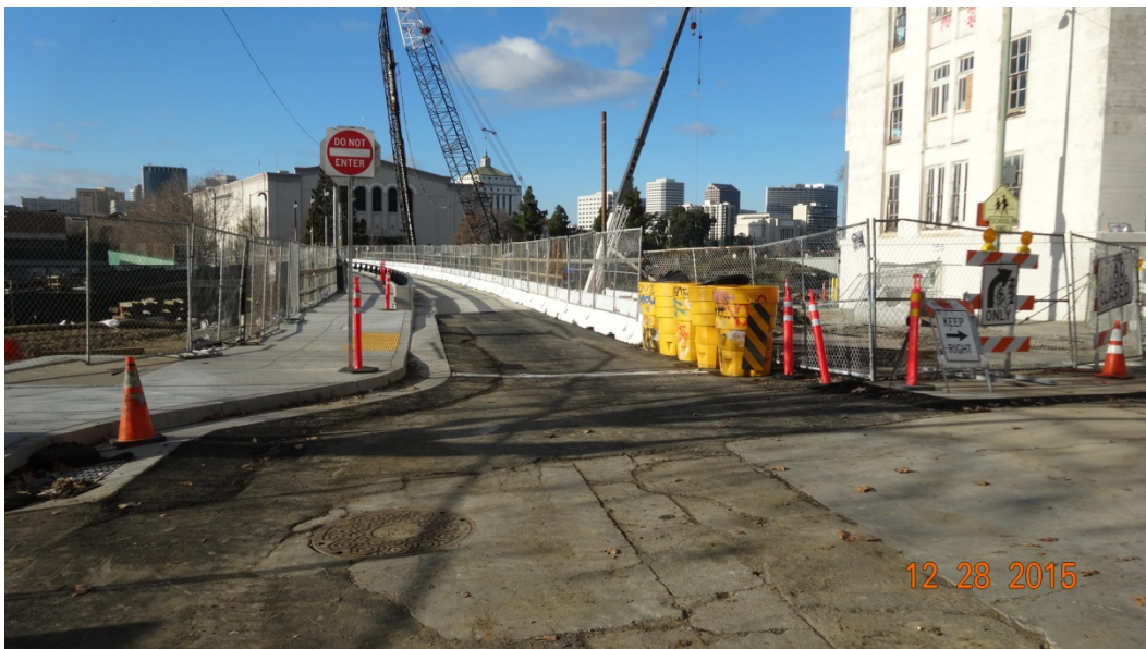
12/28/2015: Partial Opening of Southern Half of 10 th Street