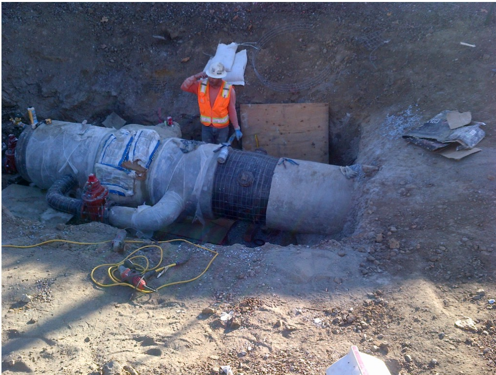
11/08/2013: Phase 1 Demo – EBMUD Water Main