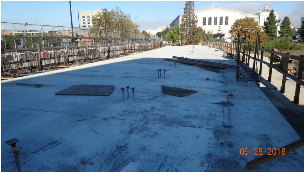
9/28/2016: Northern Half of Bridge Concrete Deck