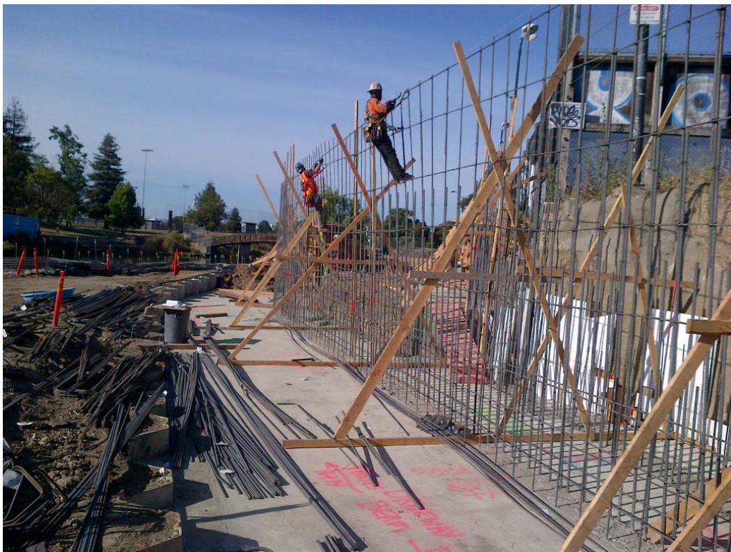
06/25/2014: Rebar for RW 1