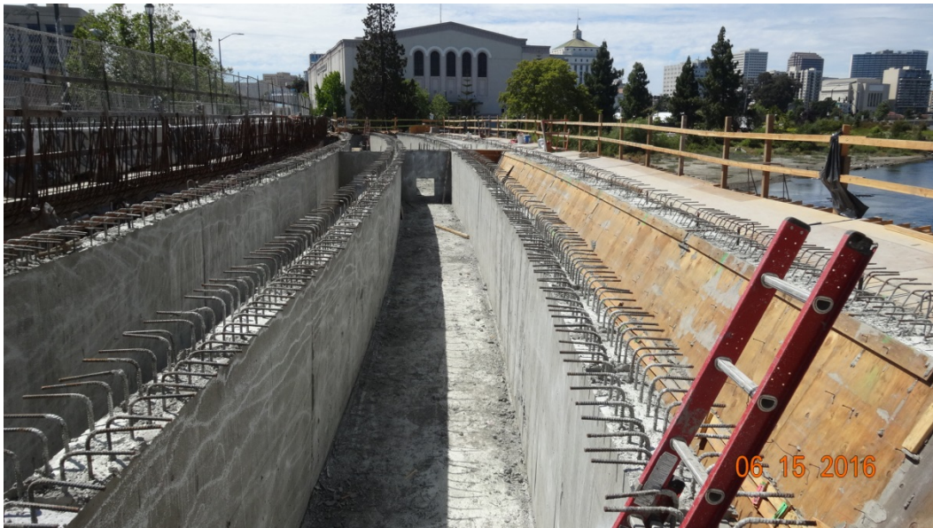
6/15/2016: Northern Half of Concrete Bridge Soffit