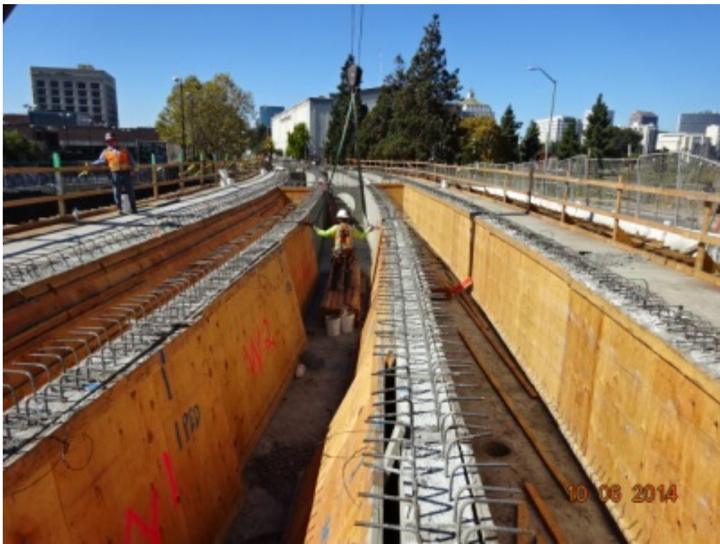
10/06/2014: Southern Half of Bridge Girder Concrete Pour