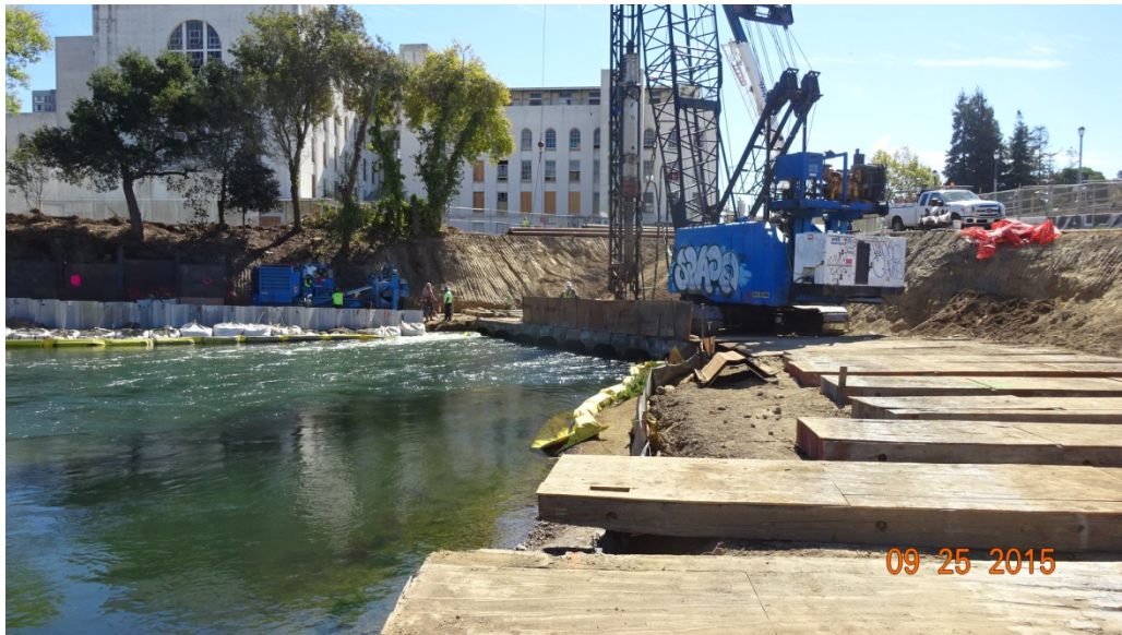
09/25/2015: EDTTEX Pile Driving for Phase 2