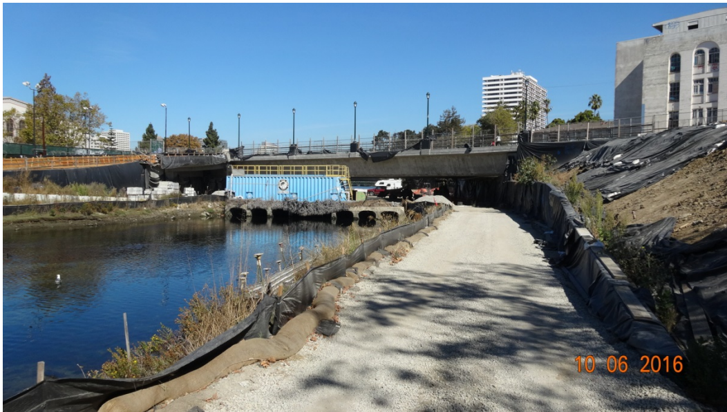
10/6/2016: View of the Bridge from South side of 10 th Street