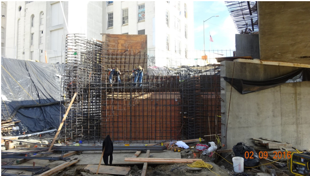
2/9/2016: Construction of Northeast Quadrant Wing Wall