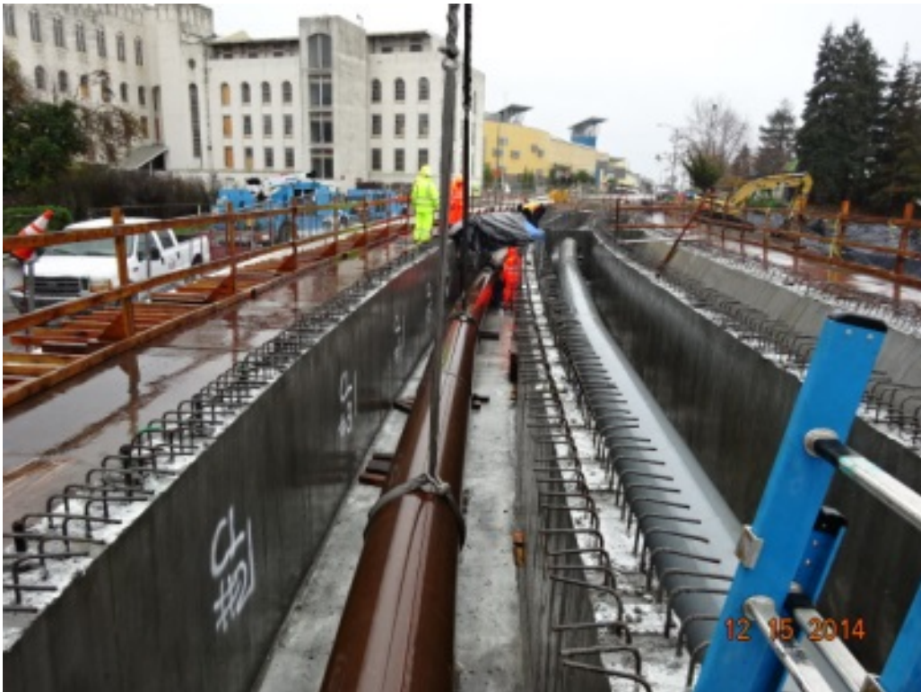
12/15/2014: New 24" Diameter PG&E Gas Main Line in Bridge Girder