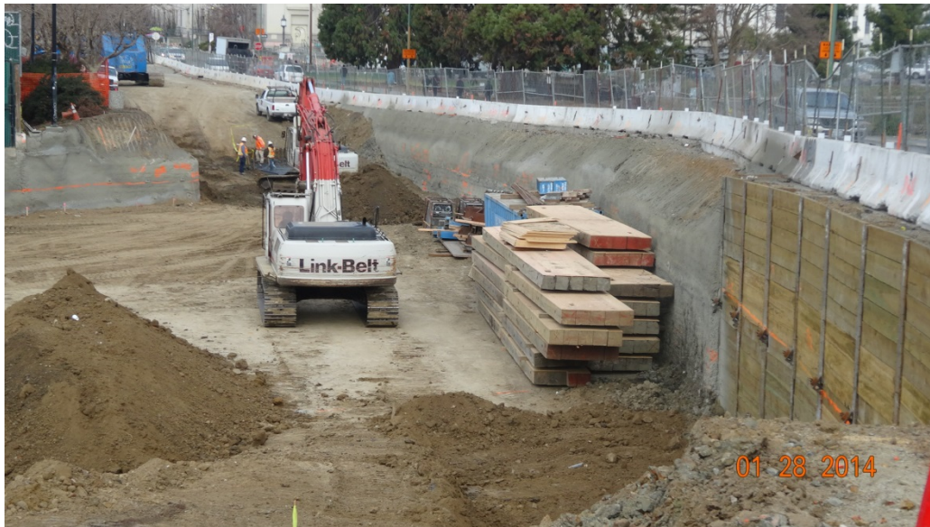
01/28/2014: Phase 1 - Southern Half of 10 th Street