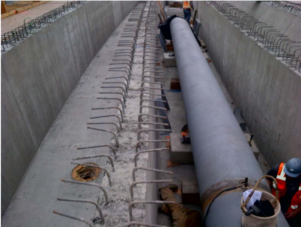
10/16/2014: New 30" Diameter EBMUD Water Main Line in Bridge Girder