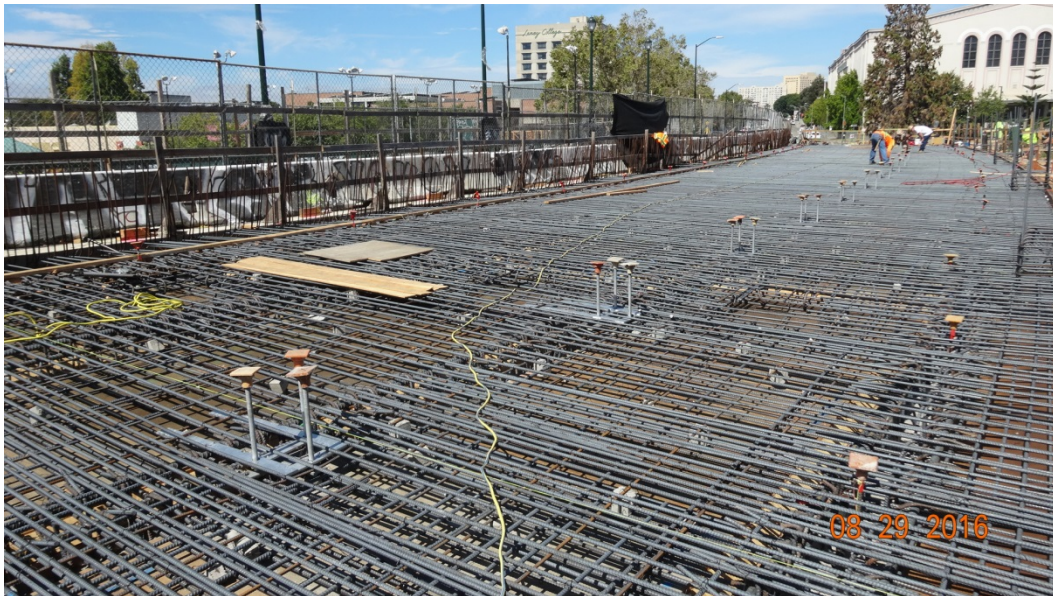
8/29/2016: Rebar for the Northern Half of the Bridge Deck