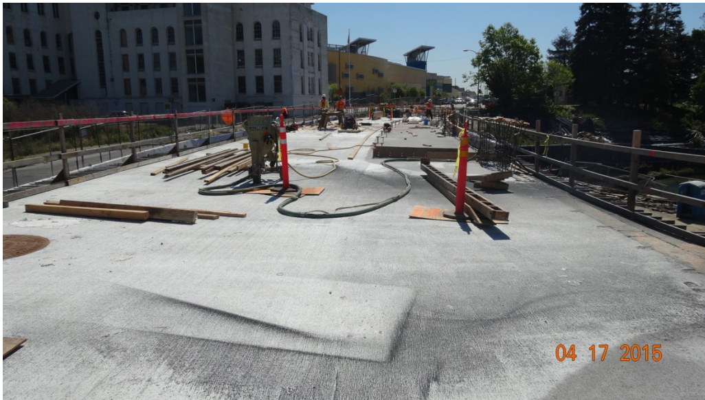
04/17/2015: Phase 1 Bridge Deck Poured