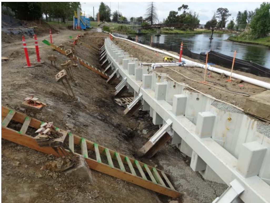
05/05/2014: Sheet Piles for SE Retaining Wall 5