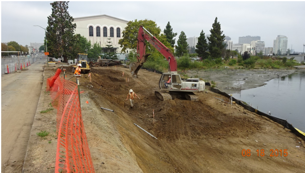
08/18/2015: Phase 2 Demolition – North of 10 th Street