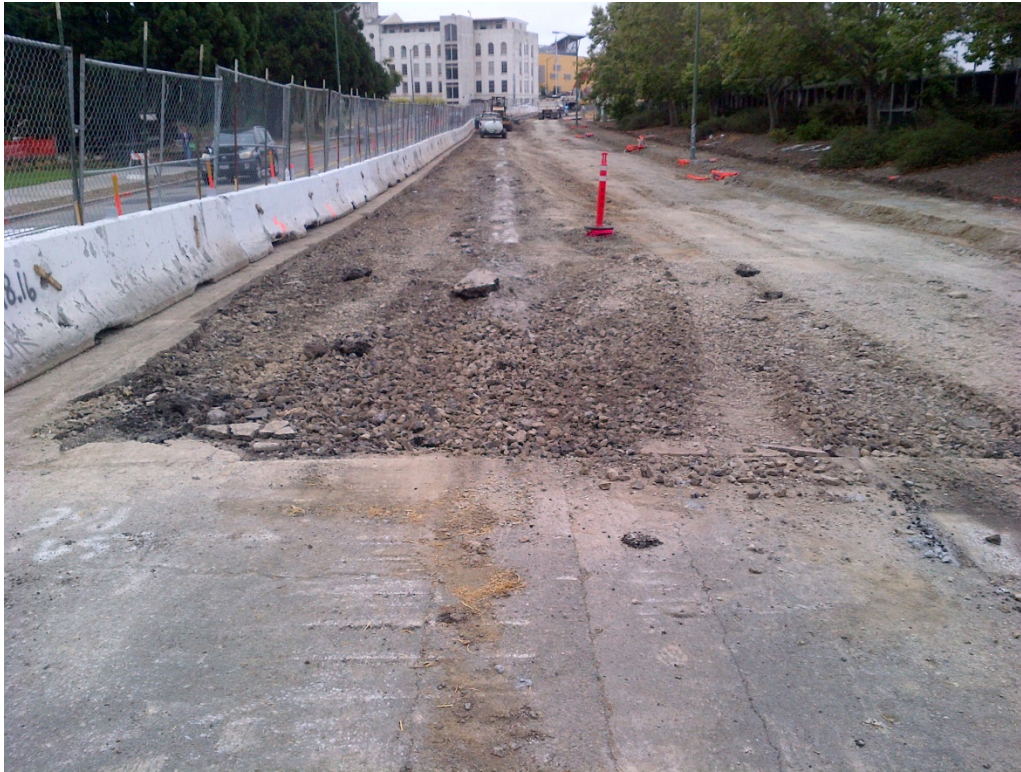
08/01/2013: Phase 1 Demo - Southern Half of 10 th Street