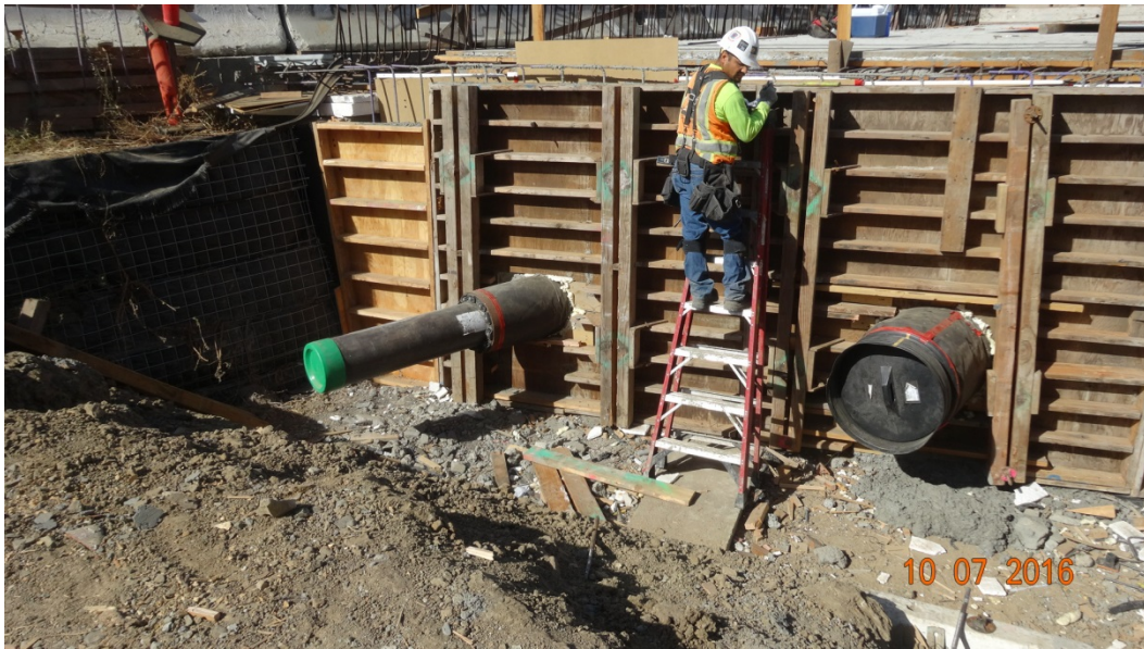
10/7/2017: Installation of Utilities on Northern Half of the Bridge Soffit