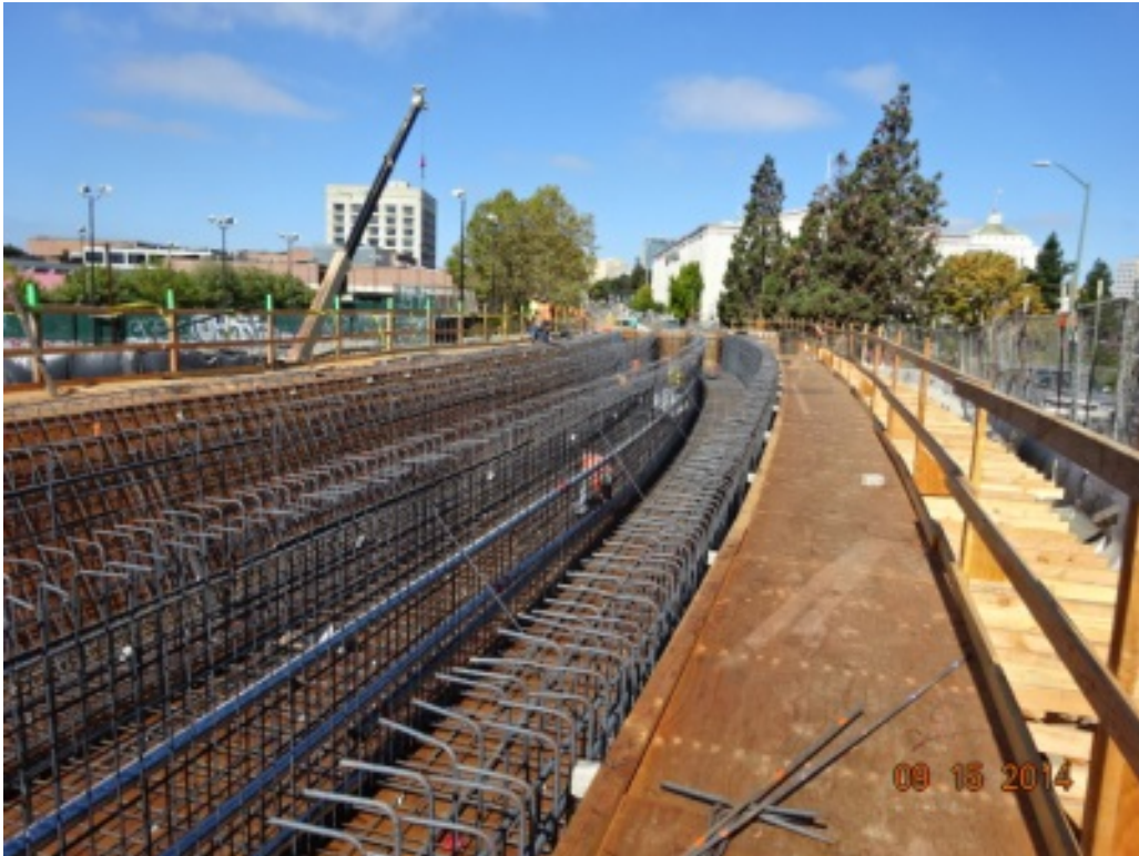
09/15/2014: Southern Half of Bridge Girder Construction