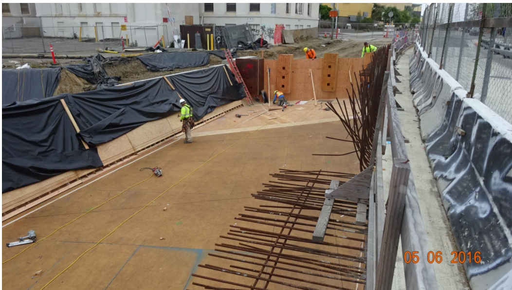
5/6/2016: Concrete Formwork for Northern Half of the Bridge Soffit