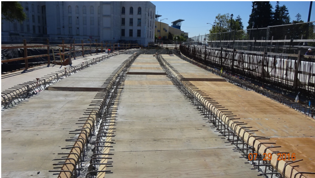
7/29/2016: Concrete Formwork for Northern Half of the Bridge Deck