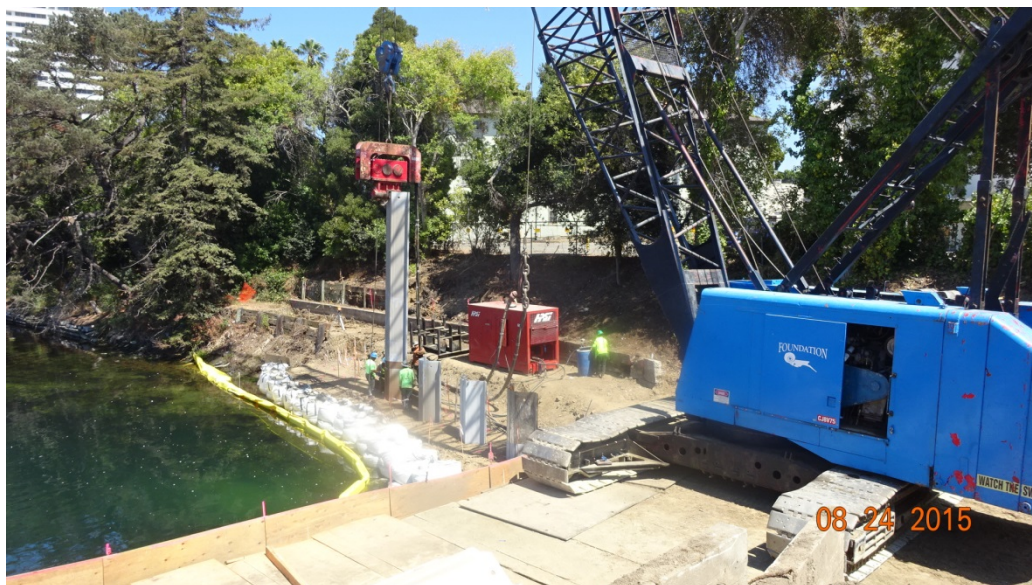
08/24/2015: Sheet Pile Driving at NE corner of 10 th Street Bridge