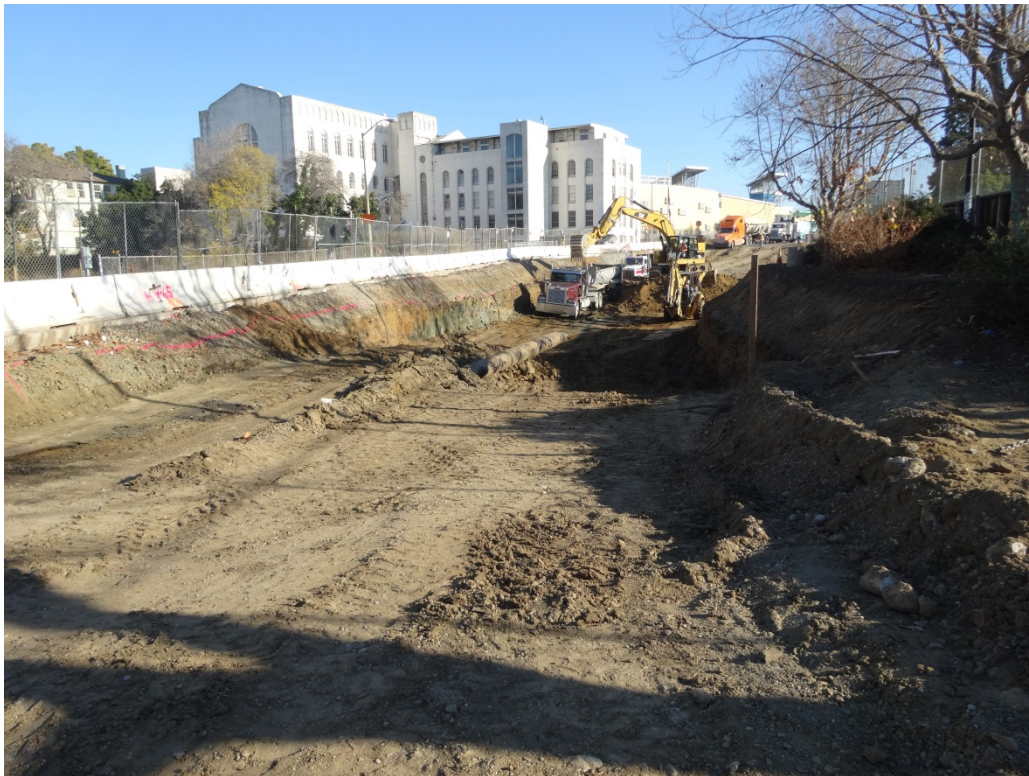
12/11/2013: Phase 1 Demo - Southern Half of 10 th Street