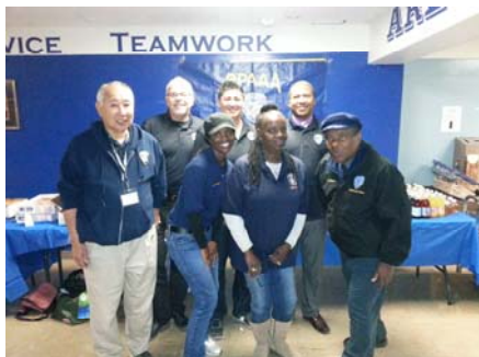
The CPAAA gather to celebrate to acknowledge Oakland Police at their Officer Appreciation Day event.

The Citizens Police Academy (CPA) held its graduation ceremony and celebration for its 34th Citizens Police Academy. Thirty-Six community members successfully completed the 14-week course. This was also the first CPA class to offer simultaneous translation in Spanish.