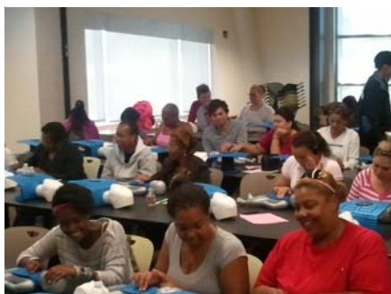
Students learning how to perform CPR at the 81st Avenue Library

In the last two years the Neighborhood Services Division (NSD) has partnered with the Oakland Fire Department (OFD) to hold CPR classes to Oakland residents in East Oakland at the 81 st Avenue Library. Since this partnership began we've had 103 participants certified. Trainings, materials and testing are provided in Spanish. We have participants come from all over the City of Oakland, ages 12 yrs+, ethnicity, city staff, parents, seniors, day care and school providers.