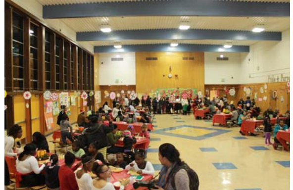
The crowd at Sobrante Park Elementary for their Christmas Party.