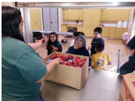
The CPAAA donates fresh fruit to the children at the Carmen Flores Recreation Center.