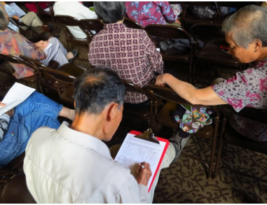
Photo caption: Seniors were signing petition at the July Chinatown NCPC meeting.

Community Victory: Youth can no longer frighten elderly citizens in Chinatown