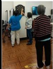
Jack London Gateway