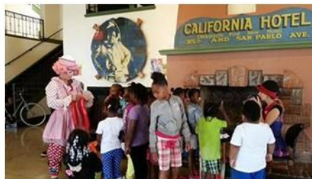
Oakland California Hotel