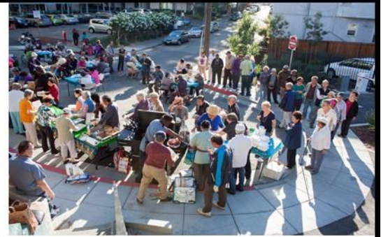
Westlake Christian Terrace