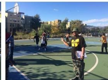
Lion's Creek Crossing