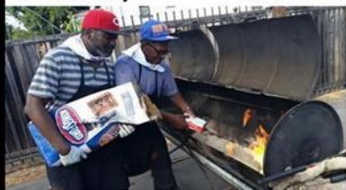
Oakland Point Limited Partnership