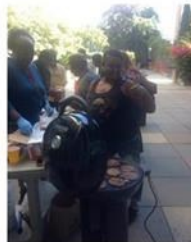
San Pablo Hotel