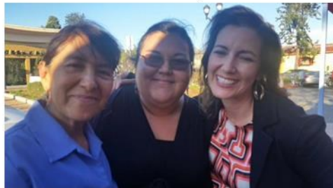
Mayor Schaaf and Oakland Residents