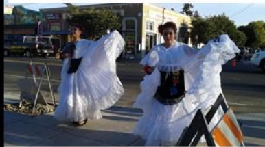
Fruitvale Avenue and Foothill Blvd