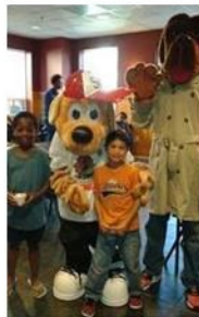
Hismen Hin-Nu Terrace