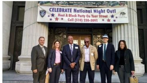
Staff From the Alameda County District Attorney's Office