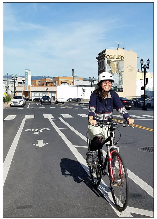
^ Clay St