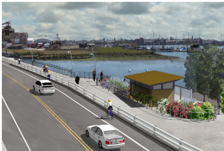
Rendering of the future Embarcadero Bridge, landscaping, and public restroom from the west. Left, view from Jack London Aquatic Center. Right, view from above roadway.